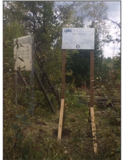
Above: The sign on Hwy 16 describing the 16,000 trees project

NRESi would like to once again thank everyone, both within UNBC and our external partners, who helped with our projects. We could not have done it without you! We hope our efforts as part of the celebration are those that will help UNBC and the northern BC community remember a very important milestone in its history and be a lasting legacy for those to come.