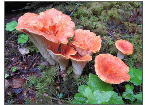
Above: An example of a non-edible woolly chanterelle, found on Terrace Mountain Species - Gomplus floccosus

Right: There was also more than just mushrooms that caught their eye... Hugues described this photo as a story about the millipede who wanted to hitchhike on a snail. Their hypothesis? It would be a seriously slow form of transit! ;)