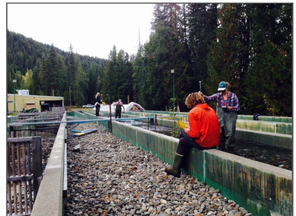
Some students at in the flumes at the Quesnel River Research Centre

REMINDER: Share your information about recent publications, grants, and/or other honours you may have received with others interested in future NRESi newsletter issues.