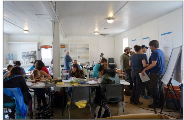
Students working in the improvised lab facility at Cassiar Cannery