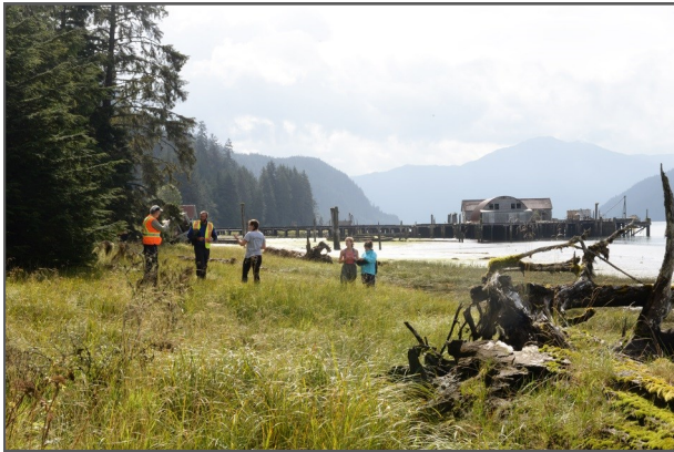
Course students examining salt marsh communities at Cassiar Cannery