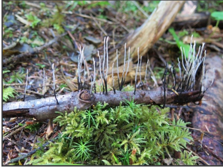
Left: Species - Xylaria