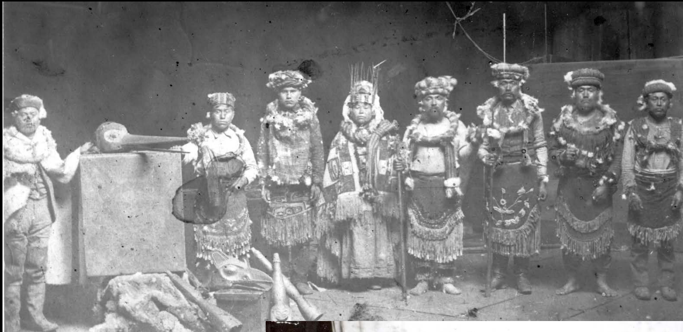
Nisga'a family, Laxgalt'sap (Greenville B.C.), 1903. Image PN 16970