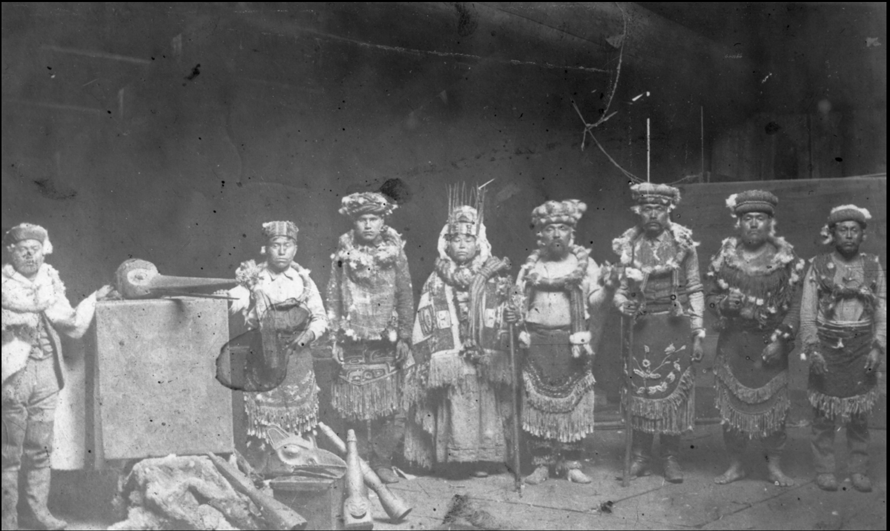
Nisga'a family, Laxgalt'sap (Greenville B.C.), 1903. Image PN 16970