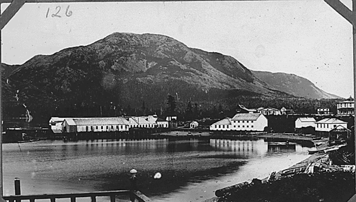
HELD NE PHOTO METLAKATN ALASKA