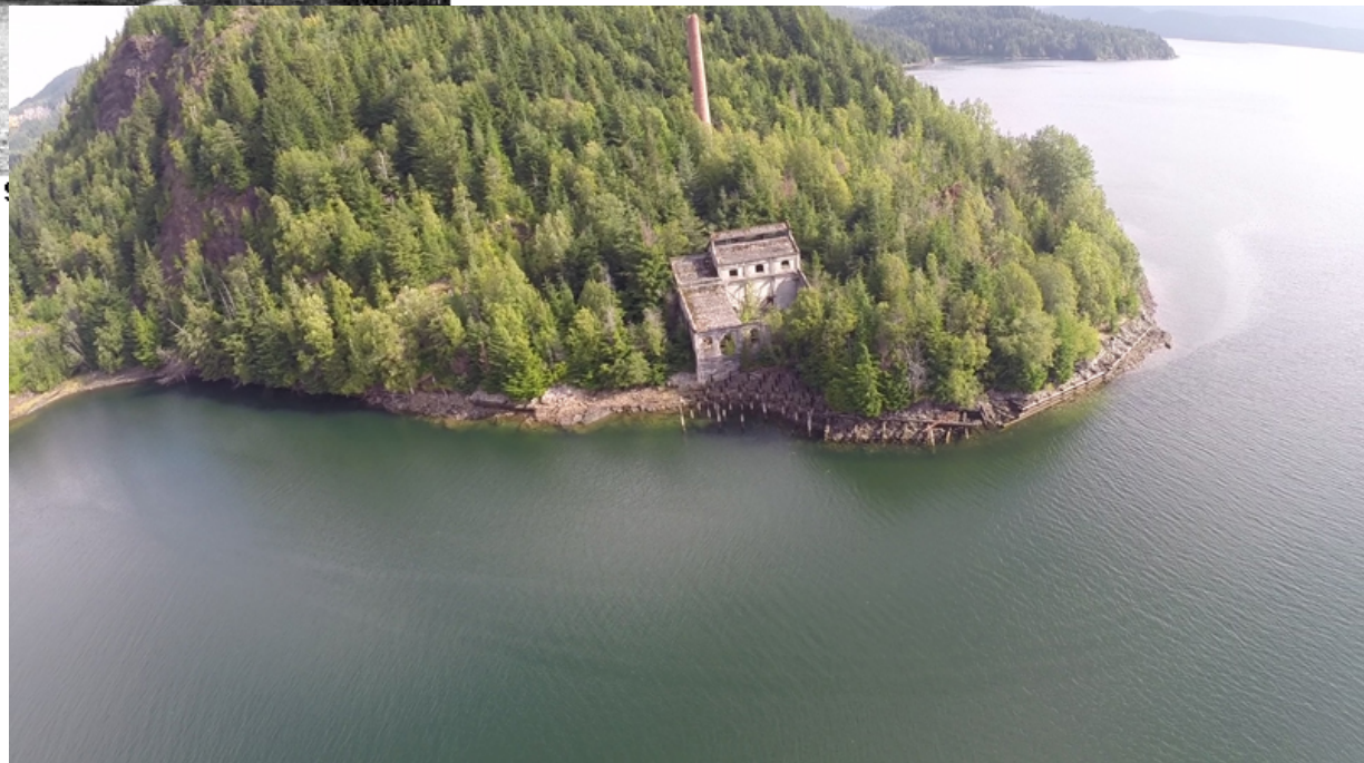
Title: Coke Plant, Granby Consolidated S