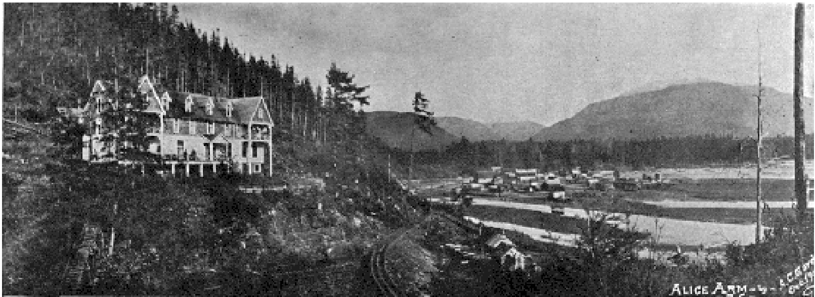
Title: "Alice Arm, BC."