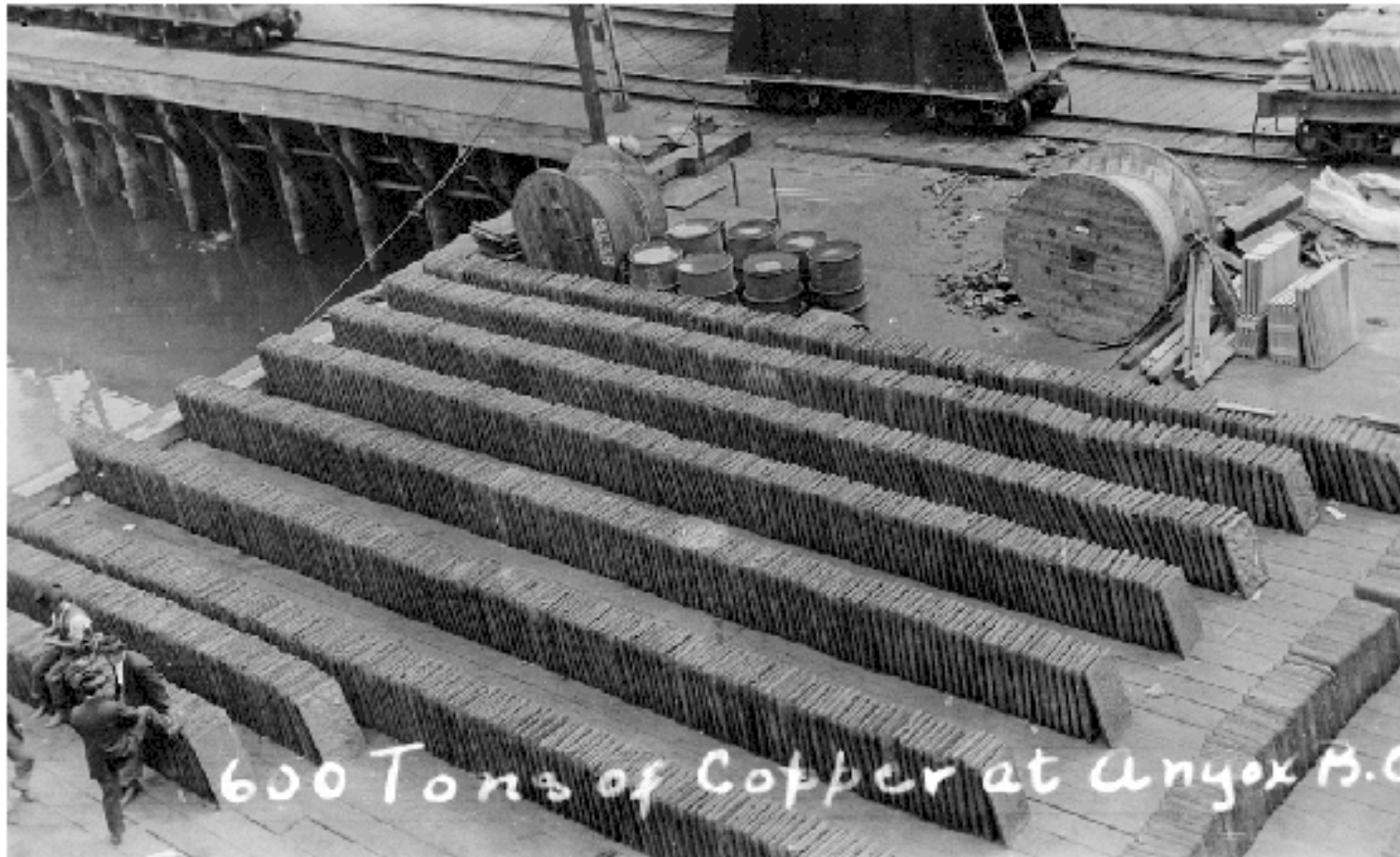
Title: 600 Tons of Copper, Granby Consolidated Smelting ...

(C) - Provided for Research Purposes Only - Other Use Requires Permission