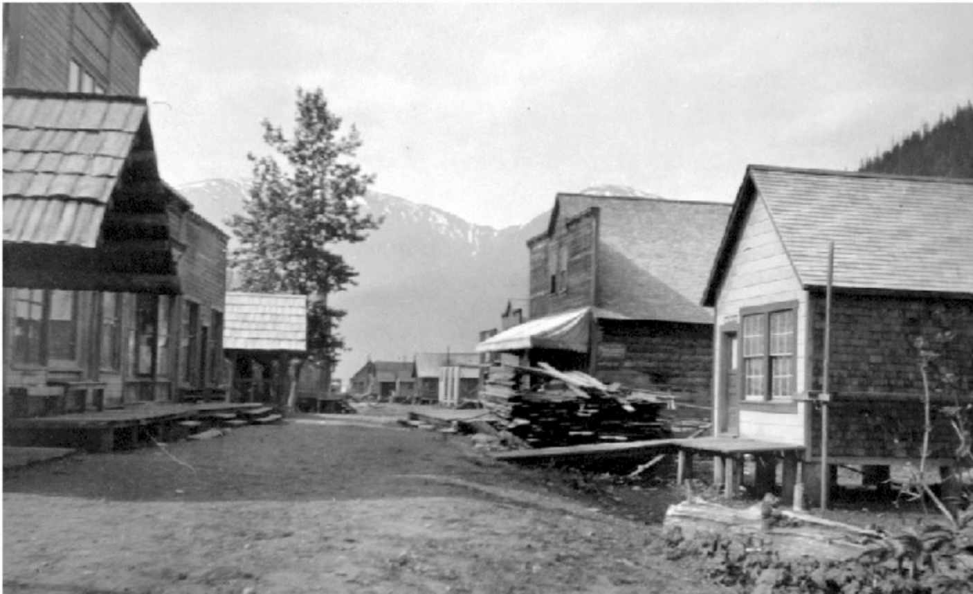
Title: Alice Arm

Courtesy of BC Archives collections - Call Number: D-01358 Web: www.bcarchives.gov.bc.ca Email: access@www.bcarchives.gov.bc.ca (C) - Provided for Research Purposes Only - Other Use Requires Permission